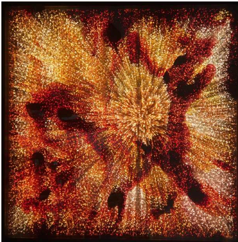
Ivan Navarro, Nebula I, 2020

The exhibition also marks uncharted territory for the artist: painting. Vivid lashings of paint are splashed on engraved one-way mirrors and illuminated by LED lights to channel celestial phenomena. Elsewhere, an ever-looping kinetic sculpture simulates the movement of an eclipse. This new approach, with an emphasis on the handmade, creates tensions between the machine and the fragility of the human hand.