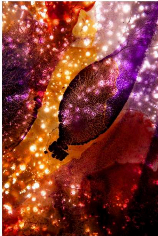
Detail view of Ivan Navarro, Nebula (2020)