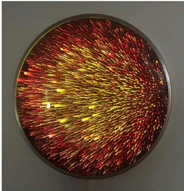
Iván Navarro, Mist IV (version 2), 2020

Using light as his raw material, Navarro draws on the structures of word play, music, minimalism, American design and architecture to address socio-political issues and alter perceptions.