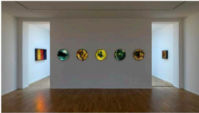
Installation view of Iván Navarro's Planetarium series, 2020, currently on view at Galerie Templon in Paris

'I try to constantly reconnect with the essence of my work; I still find myself picking up objects in the street to make sculptures, which is how I started making art in NY, recycling discarded fluorescent lights I found in the garbage. Now, since I have been more restricted to work with different fabricators and only inside my studio, I decided to do as much as possible with my own hands.'