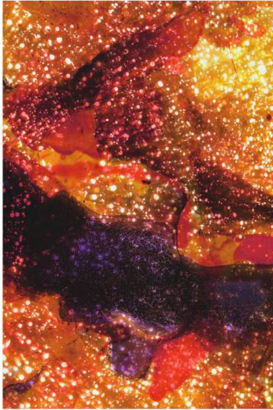
Detail view of Ivan Navarro, Nebula (2020)