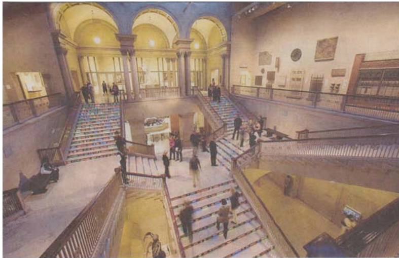
PUBLIC NOTICE 3, 2010. PHOTOGRAPH COURTESY JITISH KALLAT

THE TELEGRAPH (GRAPHITI), September 22, 2013