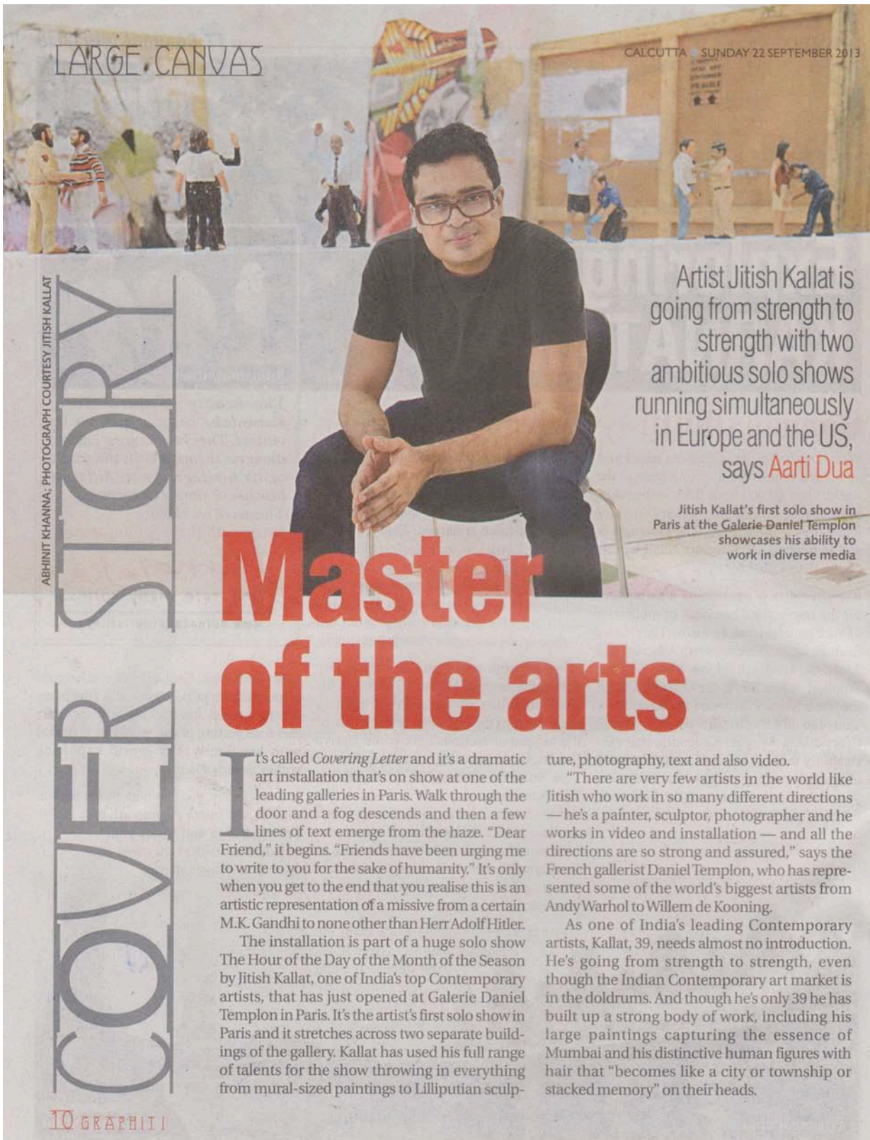
ABHINIT KHANNA; PHOTOGRAPH COURTESY JITISH KALLAT

THE TELEGRAPH (GRAPHITI), September 22, 2013