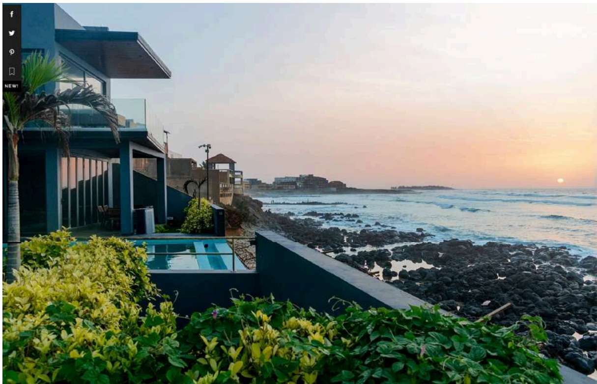
The view from Black Rock.

Our interview takes place in a living space lined with works by the photographer Dwayne Rodgers, who was specially commissioned to create a series for Black Rock. The hum of conversation drifts in from the dining room, where a group of Wiley's friends are gathered, and floor-to-ceiling windows reveal an infinity pool pouring into the Atlantic Ocean (each studio benefits from the same breathtaking vista). Inky volcanic rocks, after which the residency is named, hem the shore.