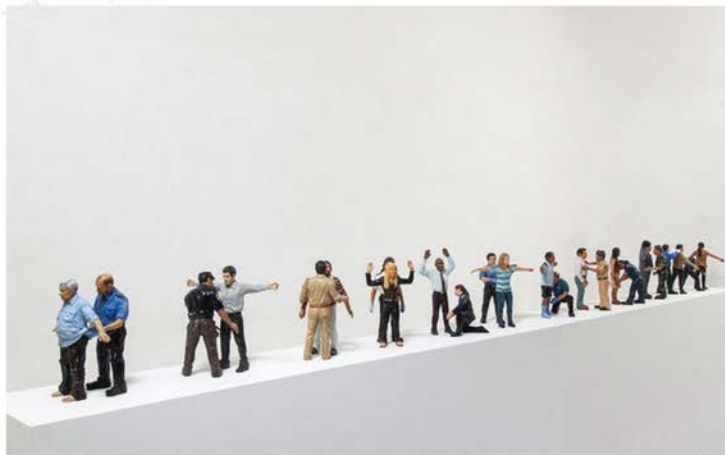
In Jitish Kallat's "Circadian Rhytm 1" (2011), figurines arranged in a row undergo body checks by security officers, a sight now familiar in an increasingly suspicious culture.

Mr. Bridle found and downloaded the plans for a type of drone used by the United States Air Force and, using string and chalk, drew a full-size outline of the aircraft on the tarmac of the parking lot behind his London studio. Seeing the form sketched out as if the drone