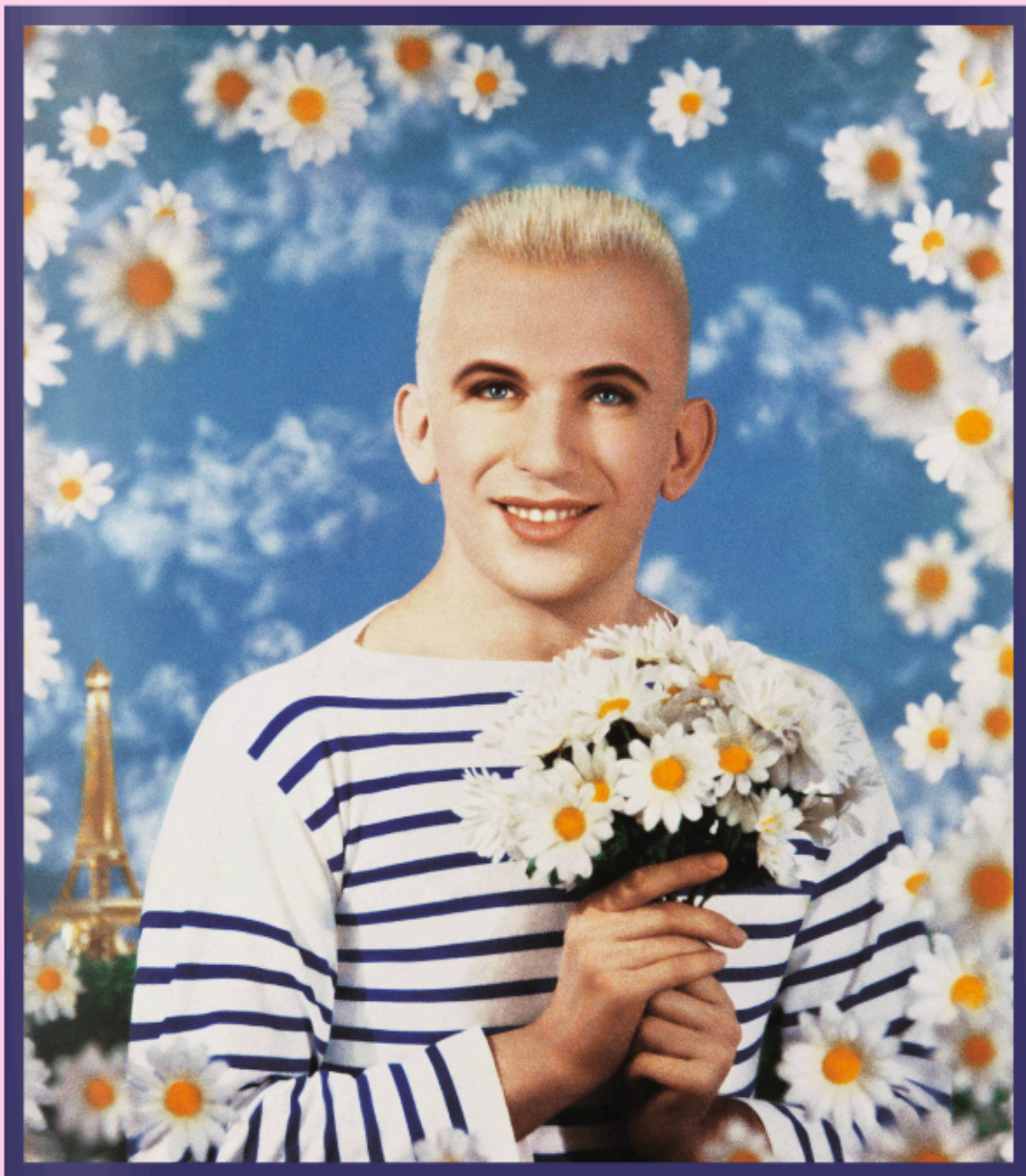
Jean Paul Gaultier