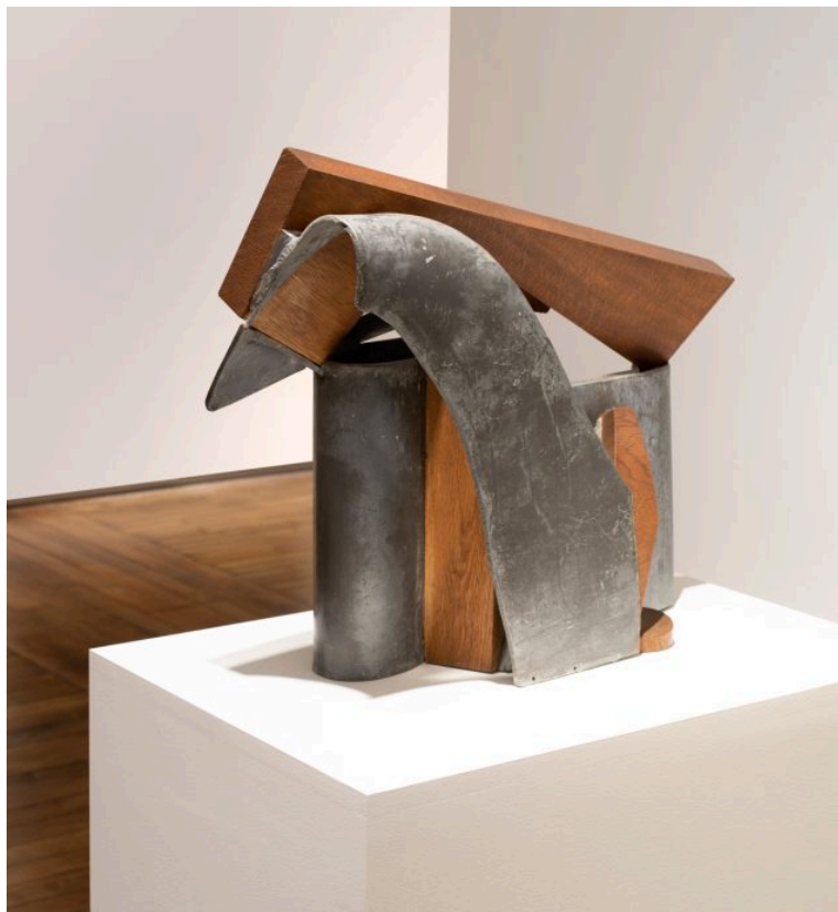
Anthony Caro Border Cut, 1984-1986 Plomb et bois / Lead & wood 48×58.5×28cm 19×23×1in.

Anthony Caro and Jules Olitski reinvented the standards for sculpting and painting, underpinned by the powerful stimulation provided by their friendship. Successors to the first New York School generation, they went on to inspire many generations of abstract artists. Galerie Templon, which represents the two estates in France, worked with the artists during their lifetime, starting in the 1970s with Olitski and during the final decade of Sir Anthony Caro's life.