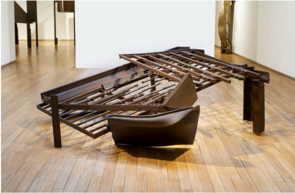
Anthony Caro Barcelona Concert, 1987 Acier rouillé et vernis Steel, rusted & varnished 73,5x203x223,5cm 29x30x88in. Courtesy Barford Sculptures Ltd & Templon Paris & Bruxelles

In Sir Anthony Caro's view: 'Sculpture sits midway between painting and architecture, particularly abstract sculpture. It lies in between. We have to find this place, in between.' In the 1970s and '80s, he focused mainly on steel, oxidised metal, the use and forms of machines and industrial elements. As for Jules Olitski, after perfecting a spray-painting technique for laying colour onto his canvases, in the 1970s he went on to develop new techniques, spreading colours with a cloth or scraper or laying them on with a roller to create thickly structured surfaces. In his work during the 1980s, the artist put the emphasis on surfaces and materials. He kept following the idea he expressed to Caro as soon as 1964: 'Well, Tony, what I would like in my painting is simply a spray of color that hangs like a cloud, but does not lose its shape.'