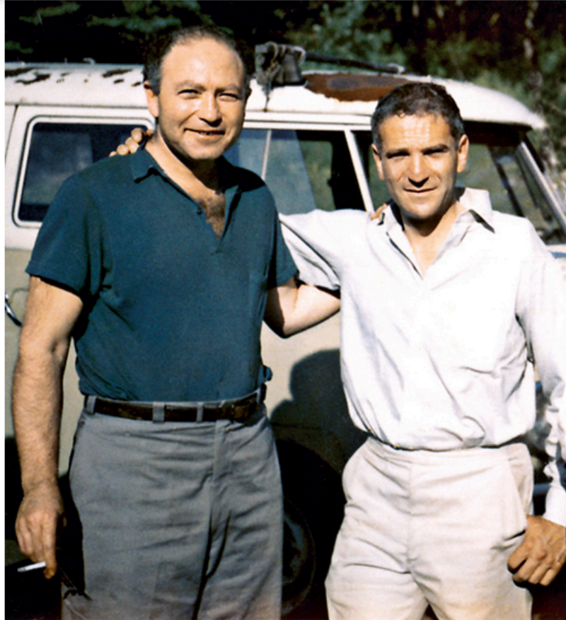
Jules Olitski and Anthony Caro, c. 1964 South Shaftsbury, Vermont, USA

Anthony Caro and Jules Olitski both paved the way to a new form of abstract art. Right from the early 1960s, they stood out for their radical experiments, tirelessly exploring new methods and materials. The exhibition highlights the capacity for innovation of two artists on a quest to redefine their medium, with their friendship as one of the catalysts. In 1963, after years of mutual admiration, Anthony Caro and Jules Olitski met and started exchanging letters, ideas and artworks. The sculptures and paintings of the 1970s and '80s reflect their research on the fundamentals of surface, space and shape, the notions of density and lightness.