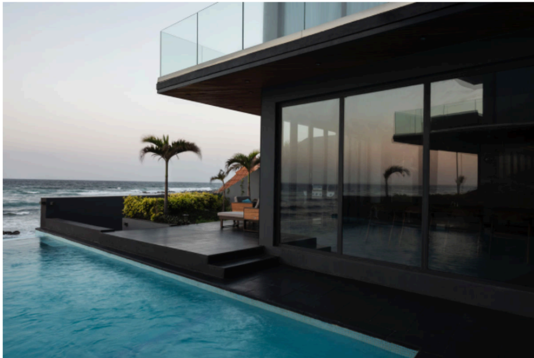
View of Black Rock compound, 2019. © Kehinde Wiley. Used by permission.

When I asked Wiley why we need yet another residency, when hundreds or thousands of such programs already exist, he was forthright and blunt: “There are not hundreds or thousands of residencies in Africa...quite possibly because of the dominant media narrative concerning [the continent], to the great detriment of the creative class in the West.”