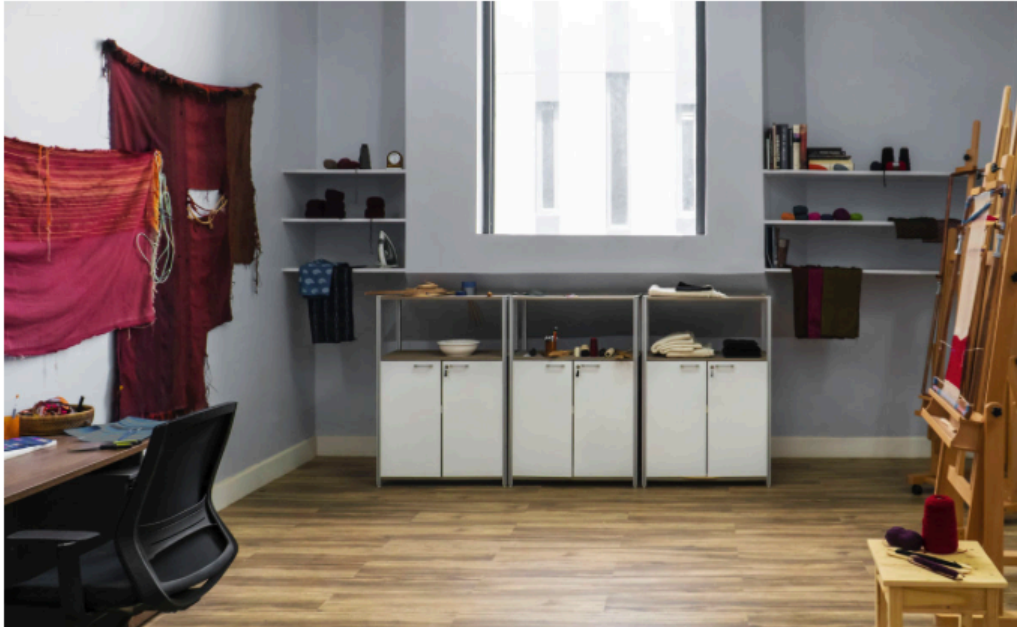
Studio space for visiting artists, 2019.