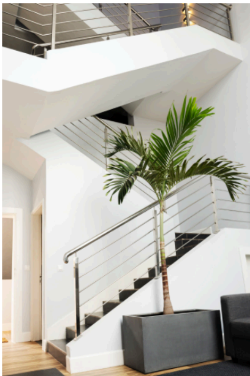
Detail of apartment for visiting artists, 2019.