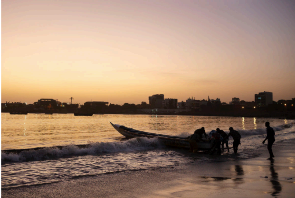
Fishermen pulling a boat up to Soumbedione Fish Market, Dakar, 2019.

Wiley himself has a residence and studio on-site, so part of the Black Rock experience will involve spending time with the man who made it possible. Still abuzz from the success of his Obama portrait, the artist sees the residency as something of a logical next step. “The Obama portrait was a phenomenal triumph that allowed for the work to be celebrated and recognized in all corners of the world, which, as a direct result, allowed for projects like Black Rock to have much more momentum and excitement surrounding them,” he said. “What I have learned from the process is that the world of entertainment, politics, and cultural evolution can be explored in a very real way—with painting on the front lines of what it means to be radically present, responsible, and a good shepherd for American leadership in the 20th century.” •