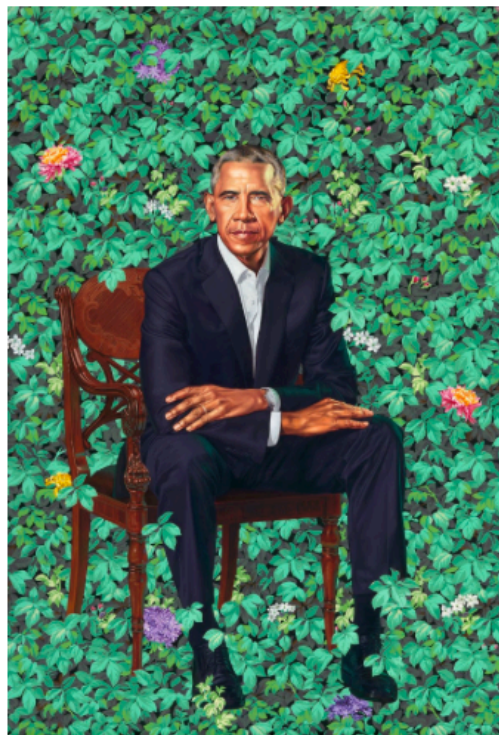
Kehinde Wiley, Barack Obama , 2018. © 2018 Kehinde Wiley. Courtesy of the National Portrait Gallery, Smithsonian Institution.*