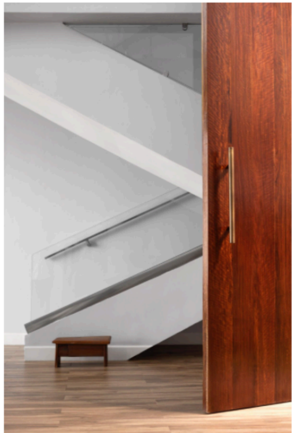
Views of Black Rock compound, 2019.