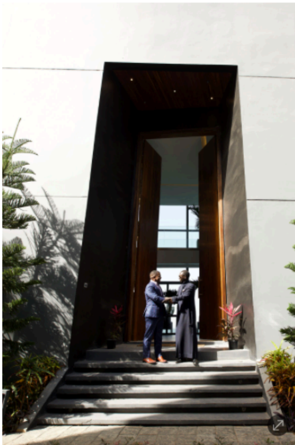
Kehinde Wiley and architect Abib Djenne at Black Rock Senegal, 2019. © Kehinde Wiley. Used by permission.