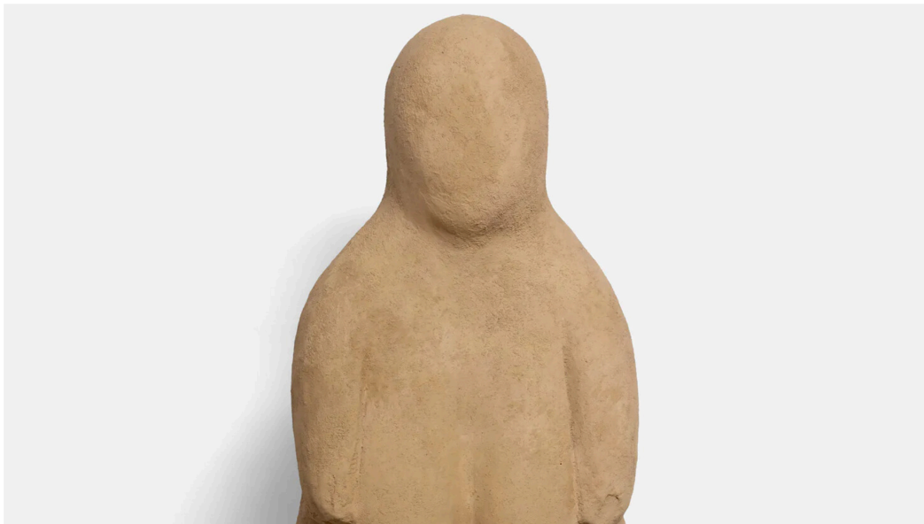
Prune Nourry, Mini-Vénus #5 bronze (Mal'ta), 2024.

11 Jan — 1 Mar 2025 at Templon in Paris, France