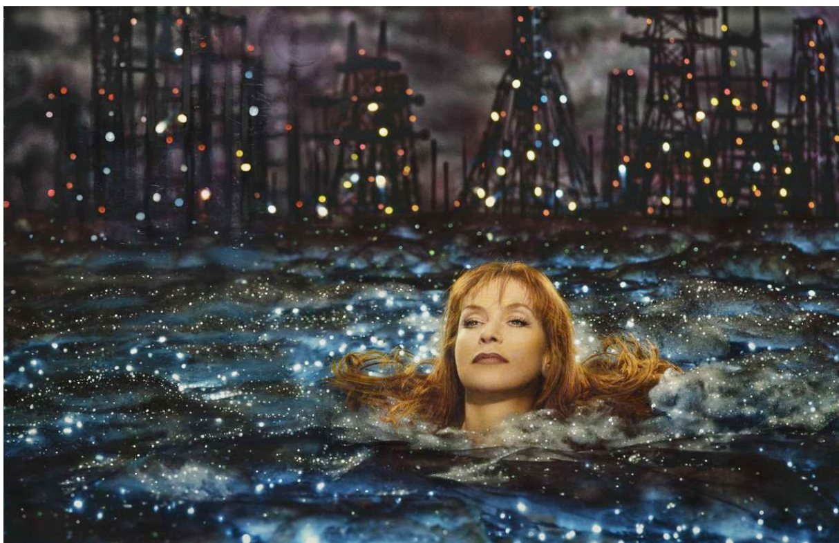
Pierre et Gilles Ophélie 2000 (Isabelle Huppert), 2012 Hand-painted inkjet photograph on canvas 78 × 112 cm © Pierre et Gilles — Courtesy TEMPLON, Paris, Brussels, New York