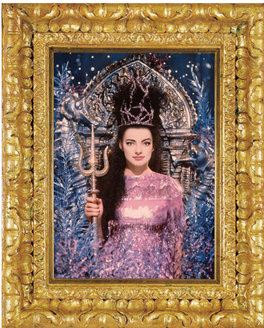
Pierre et Gilles Amphitrite (Nina Hagen), 1989 Photographie peinte à la main 94,5*74,5 cm Collection Noirmontartproduction © Pierre et Gilles

In essence, this image brings together the inspirations of Pierre et Gilles, which can be found throughout their almost 50-year career: music, the sea, but also the hijacking of the image of pop stars. It's a far cry from the singer's usual punk iconography. Here she is bathed in a pearly world, with soft, frank eyes.