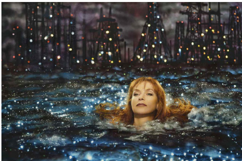
Pierre et Gilles